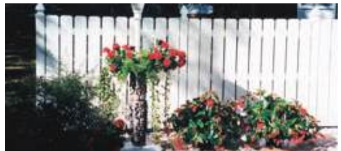
Denver* (4', 5', 6' Heights)