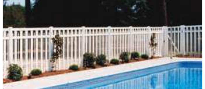
Dartmouth (4', 5', 6' Heights)