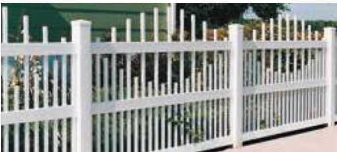
Dalton (4', 5', 6' Heights)