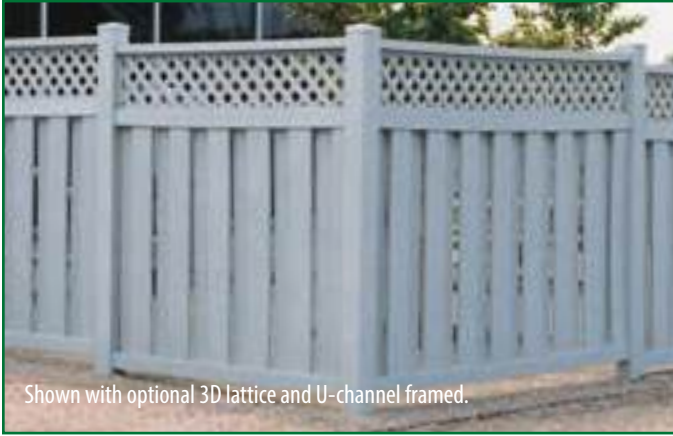
Shown with optional 3D lattice and U-channel framed.