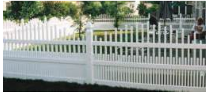
Dawson* (4', 5', 6' Heights)