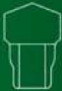
Maxwell Top Rail