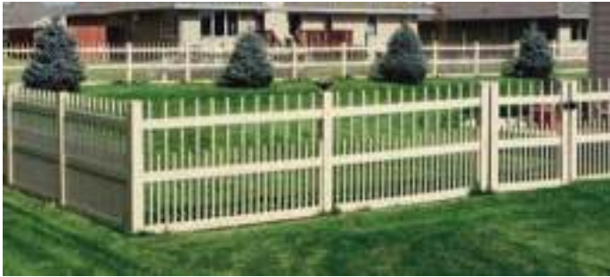
Brighton (4', 5', 6' Heights)