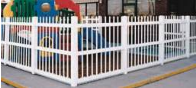
Alton (3', 3-1/2', 4' Heights)