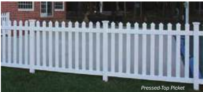
Cape Cod* (3', 3-1/2', 4' Heights)